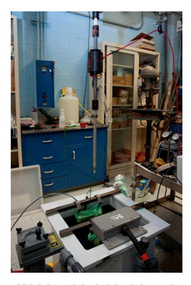
Fig. 5: Nickel electroplating bath for plating uranium metal foils

In addition to the standard aqueous electroplating process, development work began on a nonaqueous process in FY11. A basic corrosion study of uranium metal immersed in an ionic liquid yielded encouraging results which suggest that the ionic liquid could be used for nonaqueous electropolishing of uranium to prepare it for nickel plating.