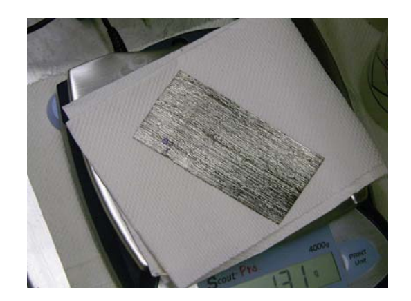
Fig. 4 LEU-foil supplied by KAERI

Currently LEU foil targets are manufactured with a wrapped nickel foil barrier. This barrier consists of a thin foil which is literally wrapped around the U foil to serve as a fission barrier so the foil can be removed from the clad if so desired. Experiments at Y-12 have shown that a nickel clad barrier can be applied to the foil through the electroplating process. Depleted uranium surrogates have been electroplated and shown strong promise of advancing manufacturing readiness levels (MRLs). Figure 5 below depicts the electroplating bath optimized for coating uranium.