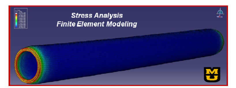
Fig. 1 ANL's LEU-foil annular target, thermal stress field

Preliminary evaluations have been performed by the University of Missouri's College of Engineering to determine the thermally induced stress on the target's cladding which is caused by non-uniform heating. A series of analytic, numeric, and experimental tools have been developed in order to evaluate the annular target geometry and to establish a proof-of-concept for the plate geometry. More advanced 2-D analytic models have been developed to establish the property and geometry groups that will influence the target behavior during irradiation. A representation of the stresses developed in an annular target is shown in Figure 1 The colors represent the Von Mises stress that results from interfacial heating. The stresses generated as a result of macroscopic U-growth and fission gas pressure will also be analyzed. A preliminary analysis applicable to both the annular [1] and plate [2] target geometry has been performed.