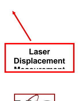
Fig. 2 Flow loop with test section

The results of the analyses and numeric simulations are being validated by experiment. A mock target, containing a heater element to provide an internal heat source, is placed in a flow loop test section as shown in Figure 2. The deformation of the target's cladding is measured by laser displacement.