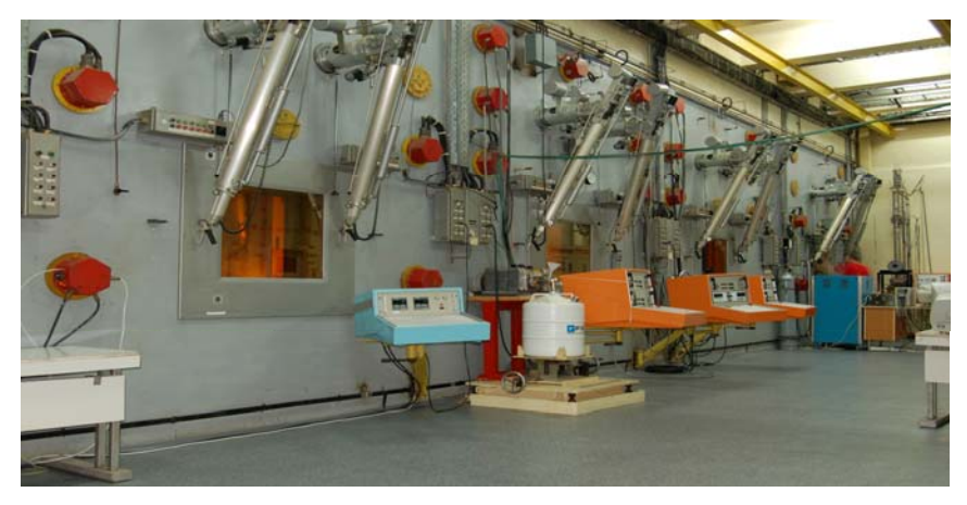
Fig. 6 Pitesti Reactor PIE Facility